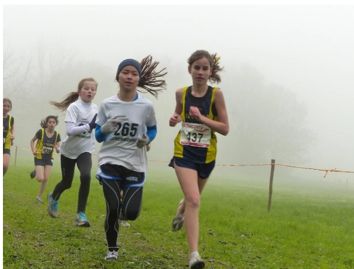
Picture of a cross country race in action.

All in all, cross country this year has been very successful.