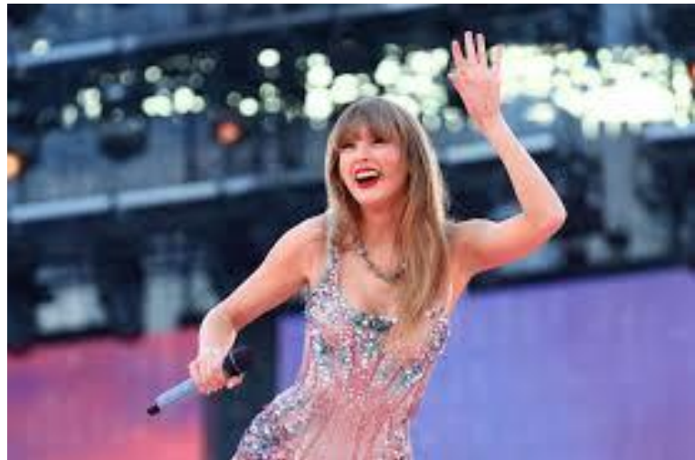
Picture of Taylor Swift during The Eras Tour

"Taylor Swift seems to put out messages promoting kindness through songs and speeches which I highly rate. To me, she seems to prioritise sharing positivity, independence and understanding."