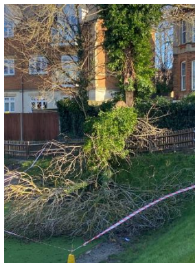
Picture of the fallen tree

On the 5th of December 2024, a catastrophe occurred - the great tree above the ramp collapsed. This meant it had to be taken down or at least that is what is thought to happen.